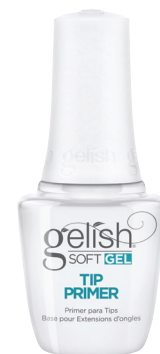
SOFT GEL TIP PRIMER