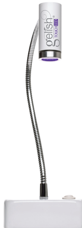
TOUCH LED LIGHT

Step 7 Cure all five fingers for 60 seconds in the 18G LED LIGHT .