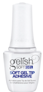
SOFT GEL TIP ADHESIVE